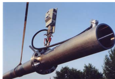
AGA Flow Meters