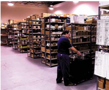
Supply Chain Parts