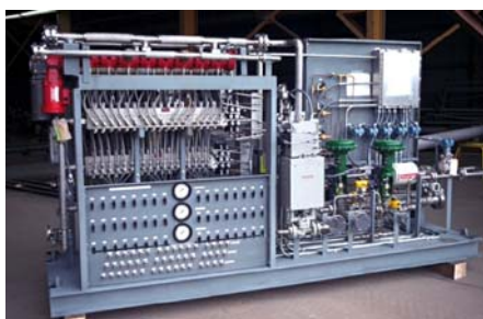
Custom Process Skids