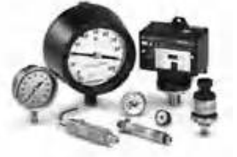
Gauges • Switches • Transducers