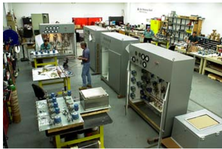
Custom Control Panels