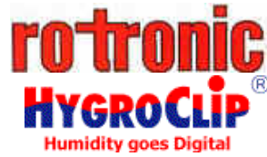
Humidity & Dew Point Meters